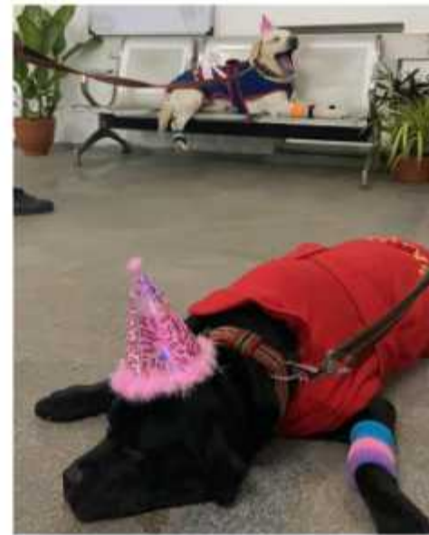
Yen (foreground) and Euro taking a well-needed breather from the festivities.

So, while the hostelites enjoyed themselves, Yen and Euro were a little withdrawn after a point of time. Bonfires and loud music are not a dog's idea of a birthday bash.