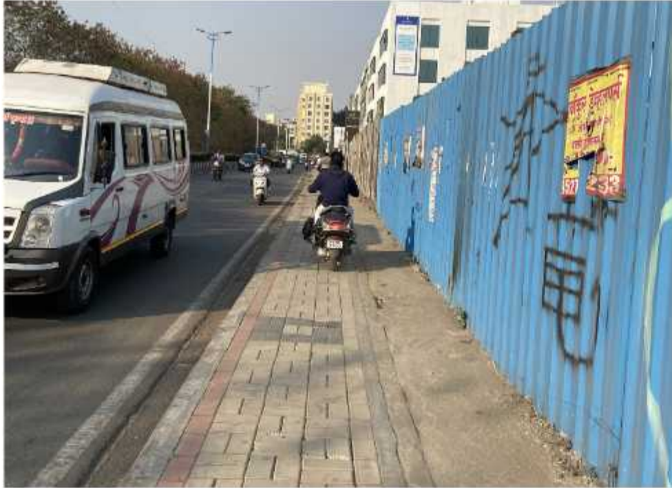
A man riding his two-wheeler on a footpath on Symbiosis Road near Sakore Nagar

By PARIDHI MAHESHWARI The footpath on Symbiosis road being used for driving is a common sight; however, the frequency with which such traffic violations are increasing is concerning. Footpaths are intended for use only by pedestrians, and riding on them can be dangerous for the rider and the person on foot.