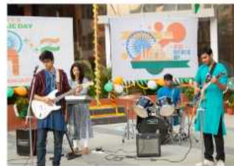
SCMS Music Club, Encore, gave a stirring performance