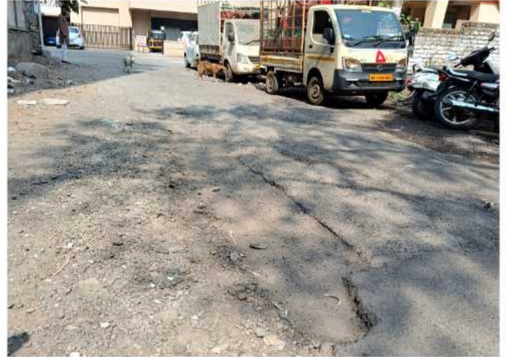
A damaged and unrepaired portion of the road

By SOHAM SHAH The horrible condition of the first lane of Sakore Nagar, which lies just before the main Sakore Nagar road when going from the Airport, has been a constant source of misery for the residents of that area.