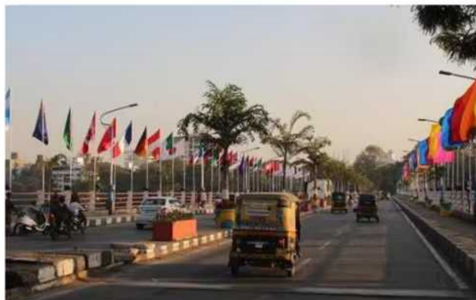
Flags of G20 nations can be seen on the stretch of New Bund Garden Bridge as part of PMC's beautification drive.

Digging was also back on the roads. SB Road residents expressed their shock as the cycle track made before the arrival of the