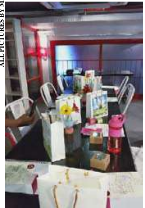
Some of the products on display at the calligraphy workshop

The workshop aims to introduce to the art and craft of calligraphy. Like all art forms, calligraphy or typography is a form of self expression. Creativity lies all around us, and all it needs is a keen eye to seek it out says Varnita Bose while talking to The SCMC Chronicle .