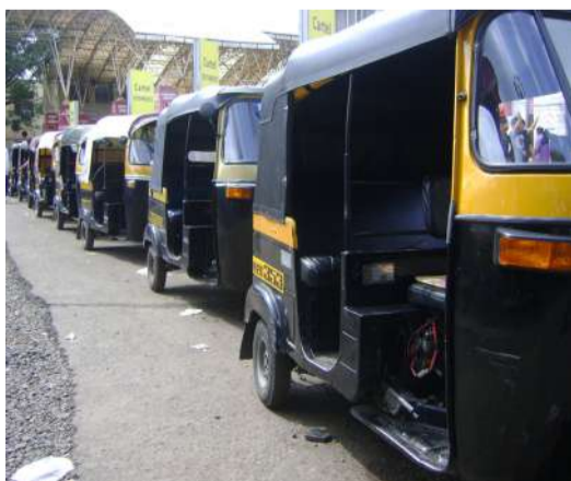
A majority of auto-rickshaw drivers are not convinced about the benefits of app-based services and operate from stands.

With cab service aggregators like Ola and Uber extending their online applications to include auto-rickshaw services, customers have benefitted by finding rides more conveniently. However, the auto-rickshaw drivers still have mixed feelings about joining the app-based service.