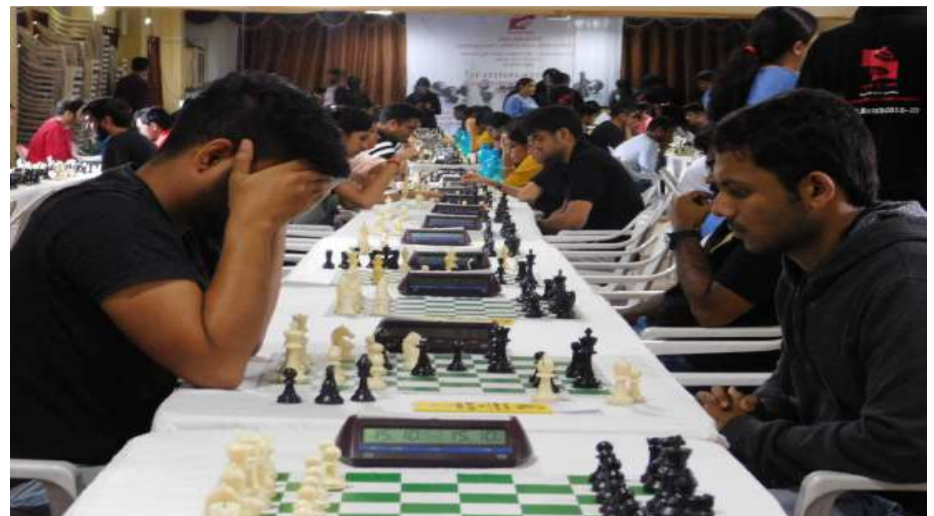
Teams from 24 colleges participated in the chess tournament