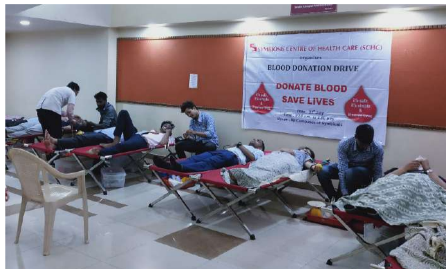
Blood donation drive in full swing at the Viman Nagar old campus

true embodiment of the motto of SCHC and Acharya Anandrishji Pune Blood Bank – selfless service with a smile. The camp saw enthusiastic participation by both students and faculty and proved to be a huge success.