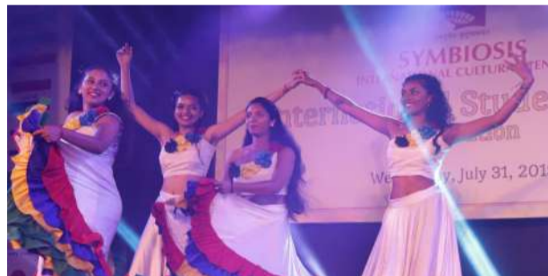
Students presenting traditional South Korean dance.

Symbiosis has students from across 85 nations. Of the 37,000 students in Symbi-