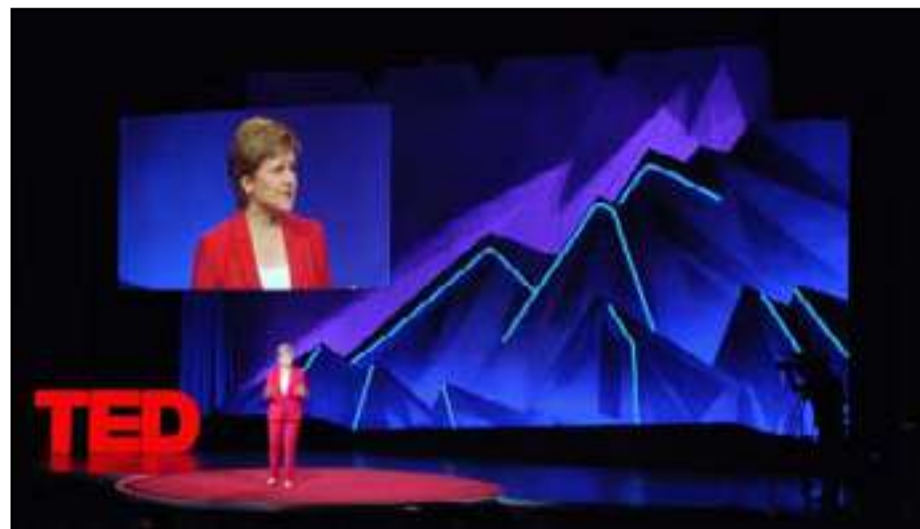
The First Minister of Scotland Nicola Sturgeon speaking at the TED Summit

However, when she sees a larger picture she believes that it is best for Brexit to not take place as it is rather a catastrophe. At the end of the day, as the First Minister and a citizen of Scotland herself, she wants what is best for her people.