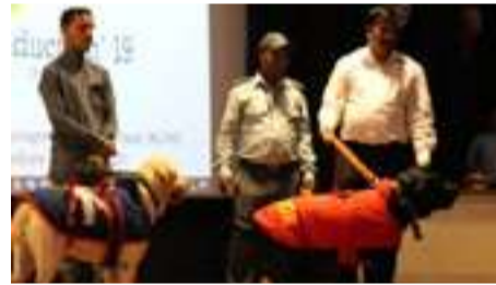
Yen (L) and Euro, the girls hostel's Labradors were also present for the Induction.

"In the corporate world, there is now an acronym for this complex situation. It's called VUCA. It stands for volatile, uncertain, complex and ambiguous," she