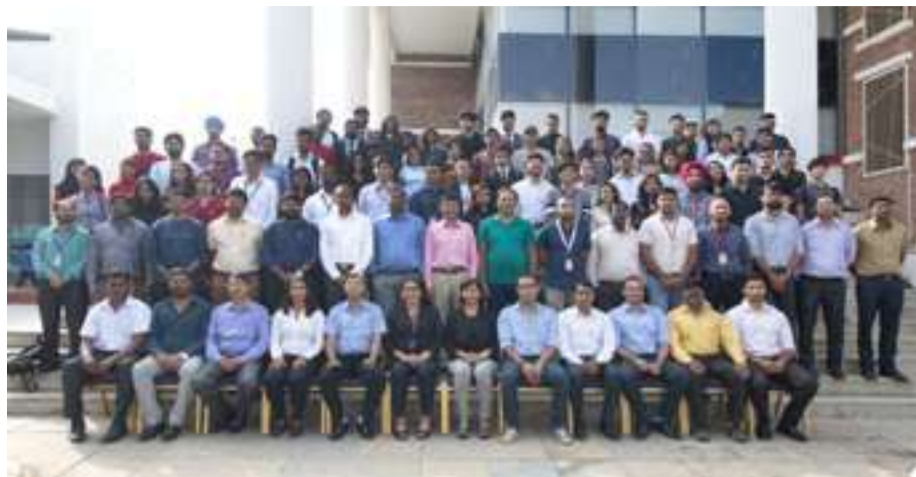
Members of DSRW, SIU Sports Coordinators (faculty), and Senior Sports Representatives at the SIU Sports board meeting held at Lavale