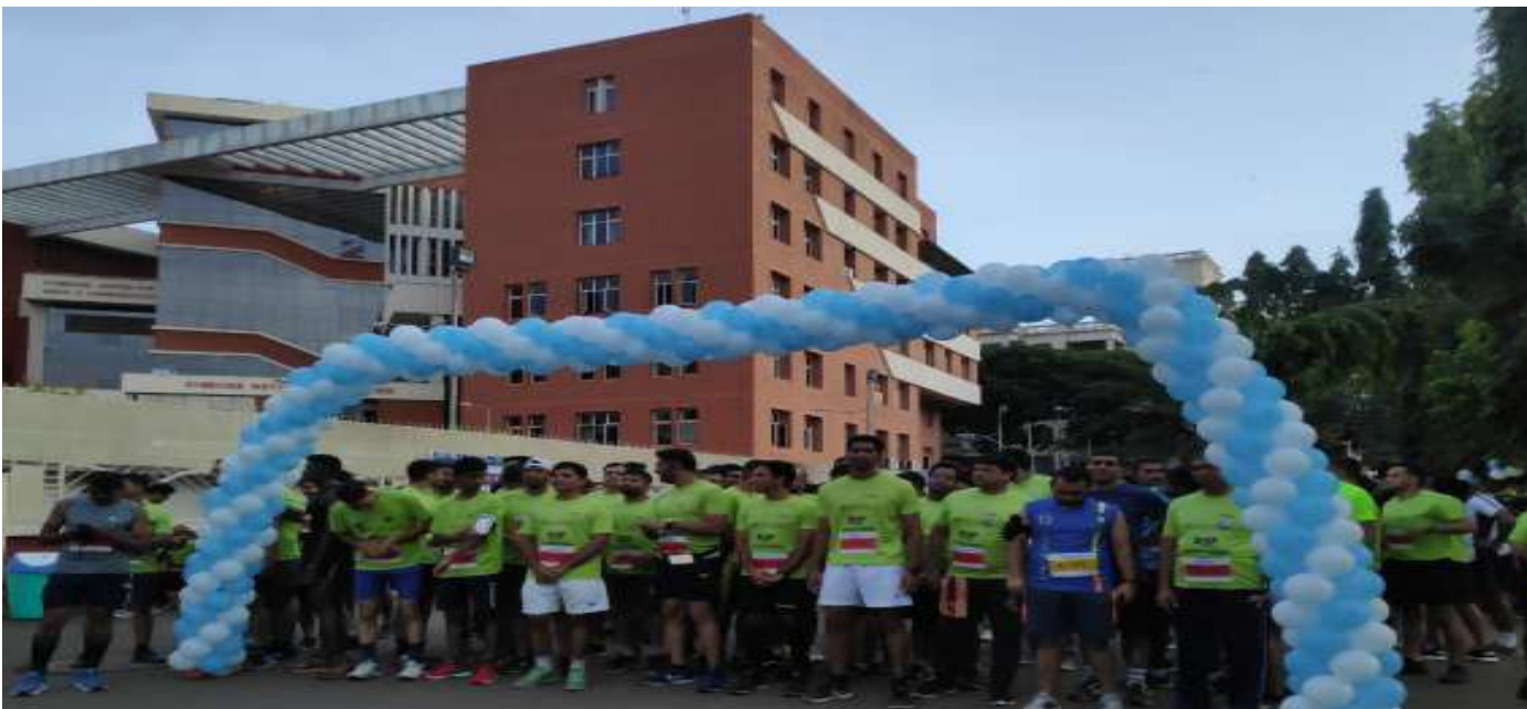
Over 300 participants ran the Neerathon to support the cause of rainwater harvesting, conducted by ExploreiT