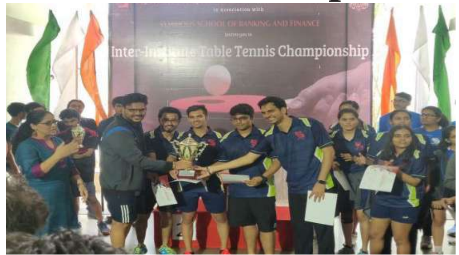
The TT team from SSSS, Pune bagged the first position in both categories.