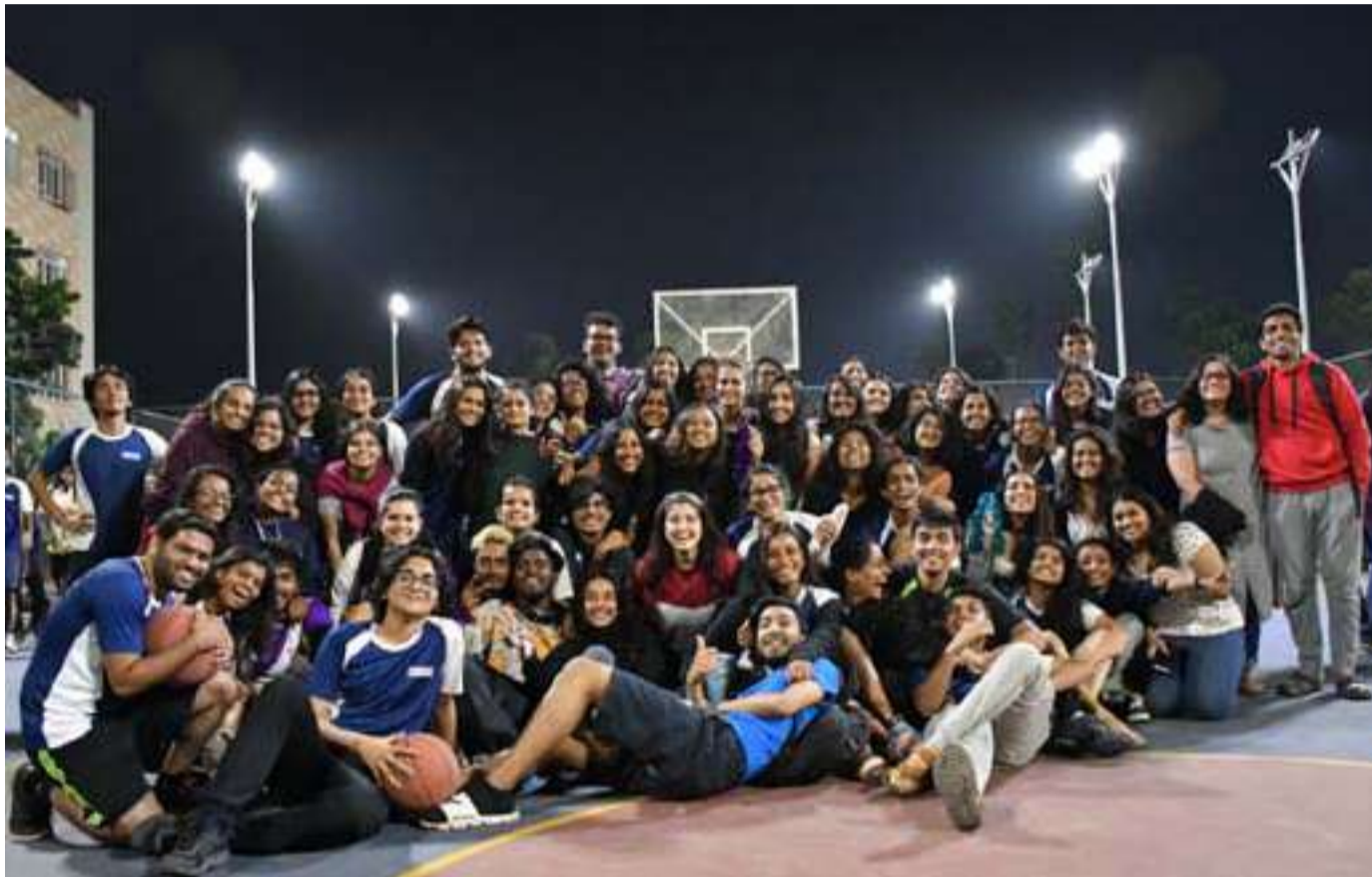
Students of Batch 2020 celebrate their ITS victory

Spread across four days and three different campuses, In True Spirit or ITS is SCMC's very own intra-college sports fest. All three batches, 2017-20, 2018-21 and 2019-22, competed against each other from 22nd to 25th January. Every batch participated in the various sports which included- volleyball, football, throwball, athletics, tennis, badminton, swimming, basketball, football and table tennis. After intense games and on-ground banter, the batch of 2020 emerged victorious for the third time in a row. All three batches left no stone unturned to generate hype off the field by creating content for the social media accounts of ITS. They had hashtags such as #FierceComesFirst, #ZiddiHaiHum and #HaarNahiManenge. With content that included spoofs of famous film scenes and a twist on famous memes, the batches managed to create a lot of buzz even before the tournament started. The table tennis matches took place on