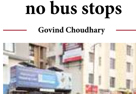
Vacant bus stop near Symbiosis Viman Nagar campus to relocate soon

A vacant bus stop without bus services near Symbiosis Viman Nagar campus has always been a hangout spot for students. Sadly, soon it will exist no more.