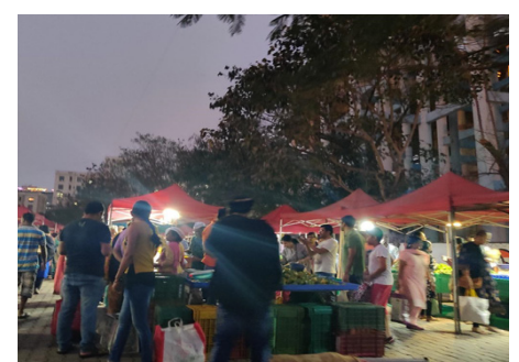
Bustling activity at the farmers' market.