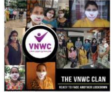
VNWC's initiative during the pandemic

With the onset of the pandemic, the organisation also began to distribute homeopathic medicines and masks to security guards. They also took the initiative to supply migrant labourers with packed food and received a contribution of over two thousand chappatis within two hours of the call being made on their platform. These food items like chapattis, sabzi, bananas, and water were sent to those in need.