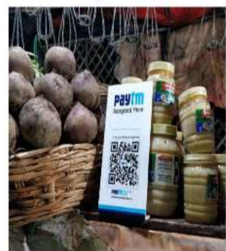
The ubiquitous UPI QR code

Due to the transparency and traceability of UPI transactions, it has become hard for people to carry out illicit transactions via UPI, especially with large sums of money. Looking at the huge success of the