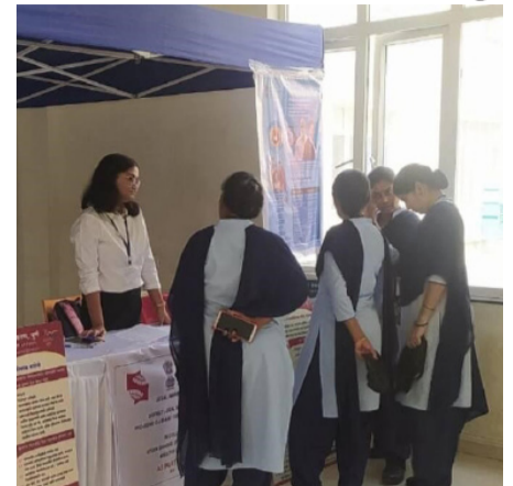
A Legal Aid Camp set up along with the Community Legal Care Centre