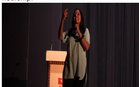
A speaker addressing the audience.