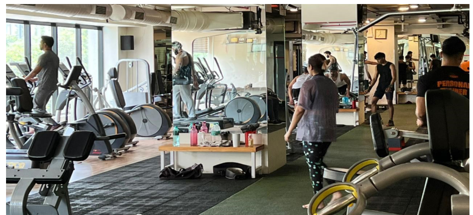
People working out at a gym outlet in Viman Nagar.