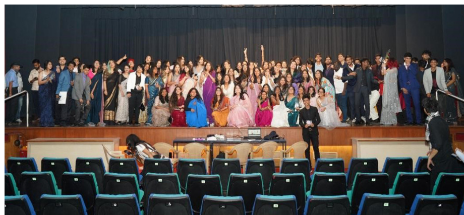
Batch 2022, signing off.